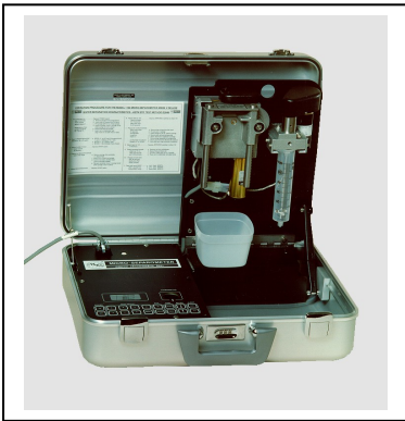
Model 1140 Micro-Separometer